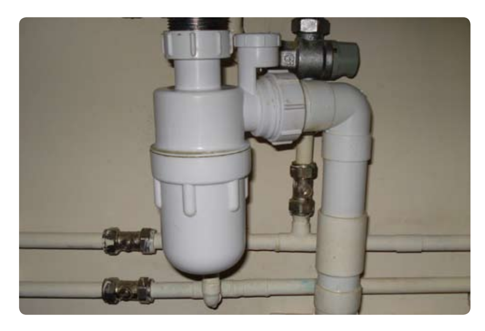
Step 7; Turn on water and check for leaks.

WaterCoolers Direct.com Ltd offer this set of instructions as 'Guidance Only'. Therefore, WaterCoolers Direct.com Ltd and its employees or representatives cannot be held responsible for any work carried out by YOU and/or ANY third party using the instructions either in writing or over the telephone via the HelpDesk.